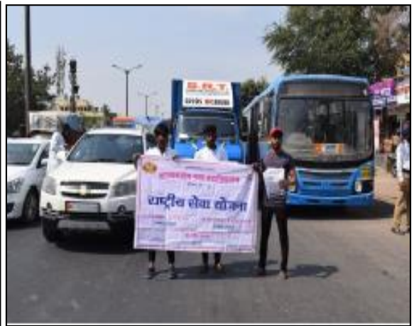
Traffic rules awareness among people by group of students at Hadapsar Gadital