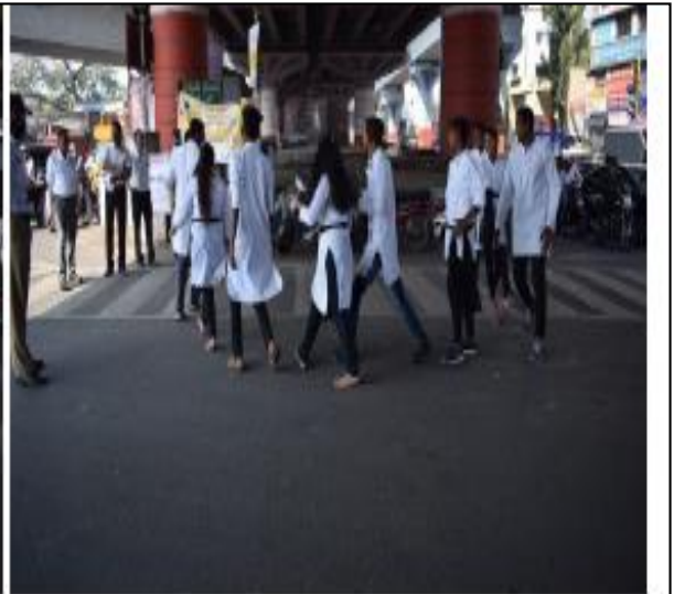
Street play by group of students at Hadapsar Gadital